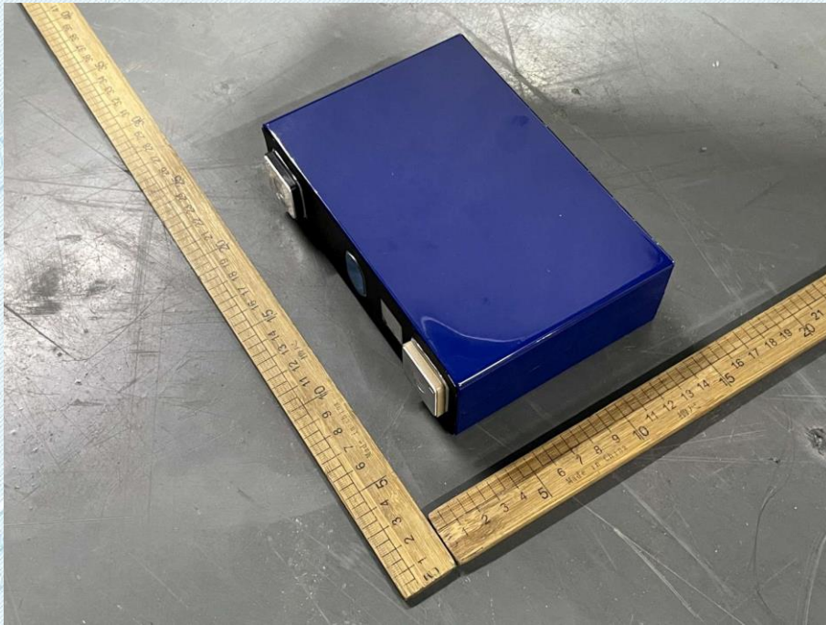
Figure 3 Front view of cell