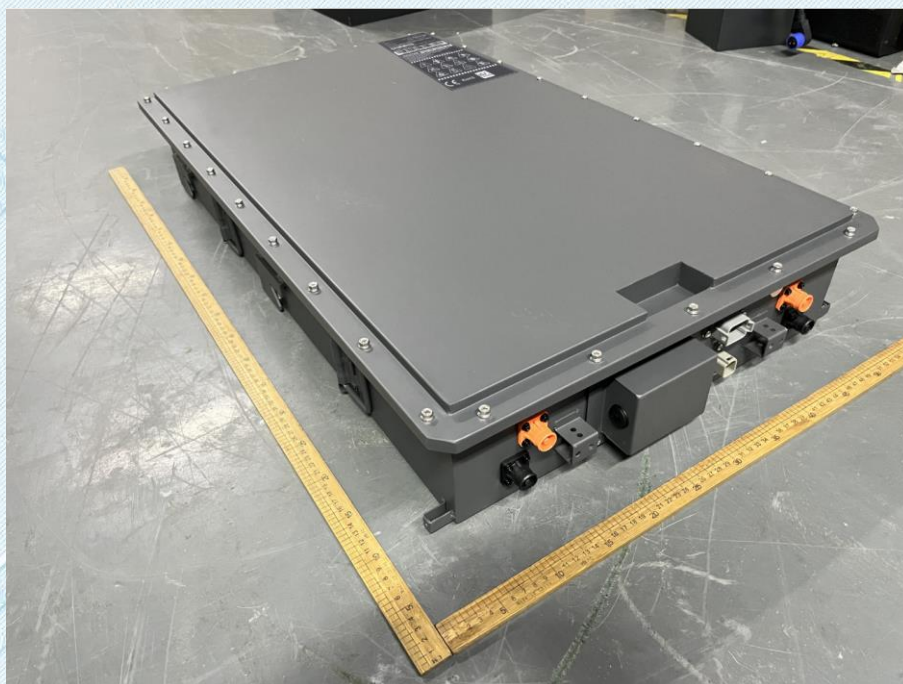
Figure 1 Front view of battery