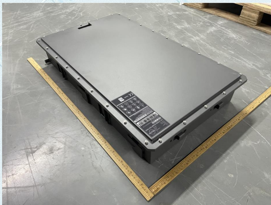
Figure 2 Back view of battery